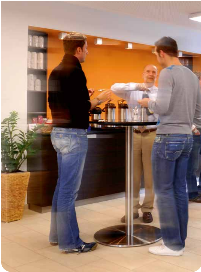
The courses offer a perfect opportunity for close contact to the lecturers.