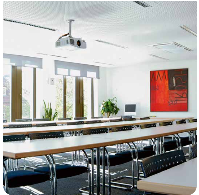
The courses take place in a pleasant atmosphere.